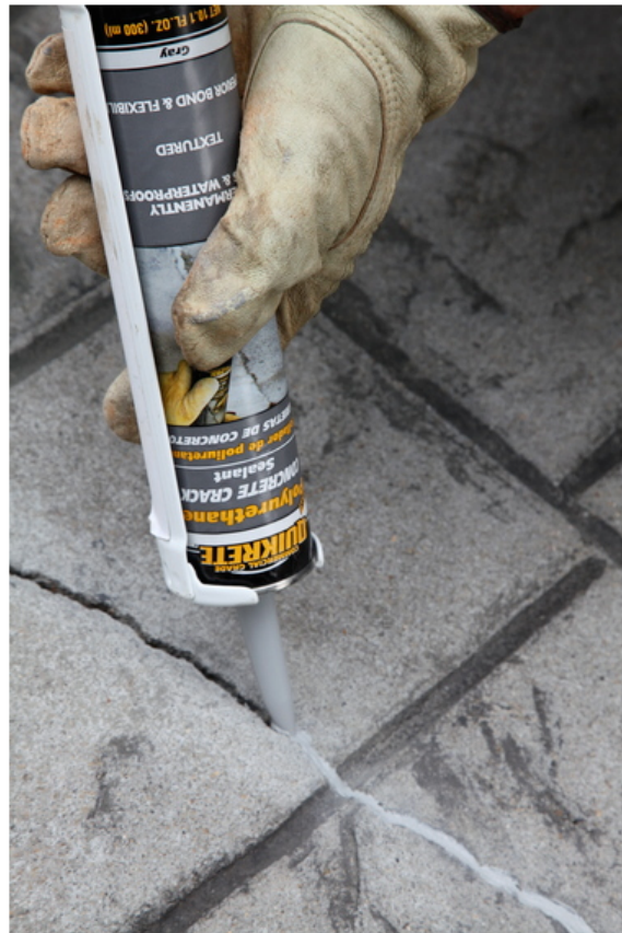
Seal and make repairs to concrete and other masonry areas around your home before the damage grows. | QUIKRETE

United Gilsonite Laboratories offers DRYLOCK Concrete Protector with SaltLok. The low sheen clear coat has a well-worn artisan look that retains the natural look of rough cobblestones, stamped concrete, tumbled pavers, and flagstones. SaltLok technology helps prevent efflorescence, the white powdery residue caused by leaching of natural materials onto the surface of masonry and mortars.