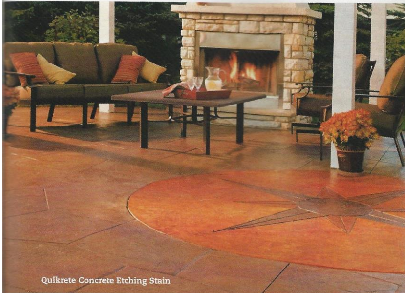
Quikrete Concrete Etching Stain