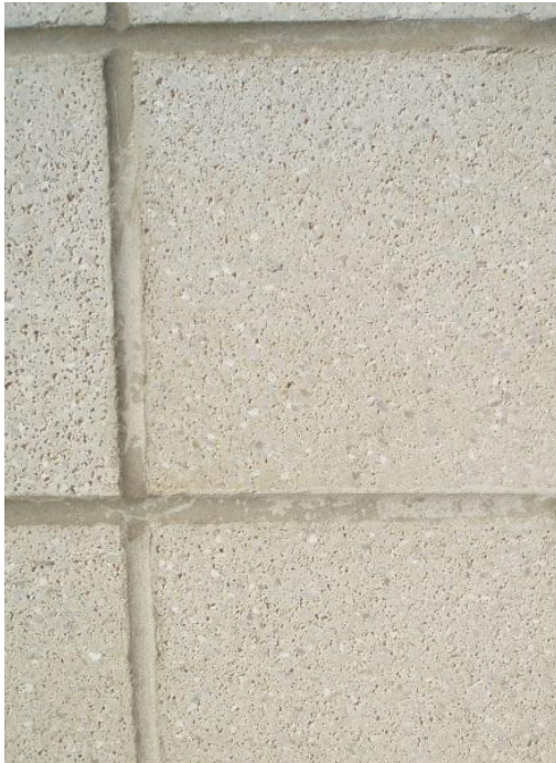
Surface Mottling of Mortar Joint

CMUs and mortars that share similar properties should be matched together on projects. For example, architectural CMUs are densified in the manufacturing process to help create a unique finished appearance. This process makes the CMU less permeable and prone to swim or float when being installed by mason, slowing down the installation process. This also leads to onsite tooling and curing difficulties including unsightly surface mottling of the masonry joints, a condition where the cement paste cures at uneven rates at the surface of the joint only.