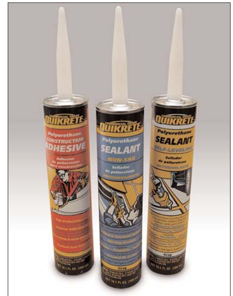
QUIKRETE® Polyurethane Sealants and Construction Adhesive